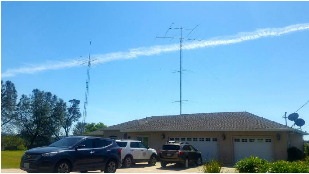
CQ WPX SSB from WC6H. Shown are two of the three towers