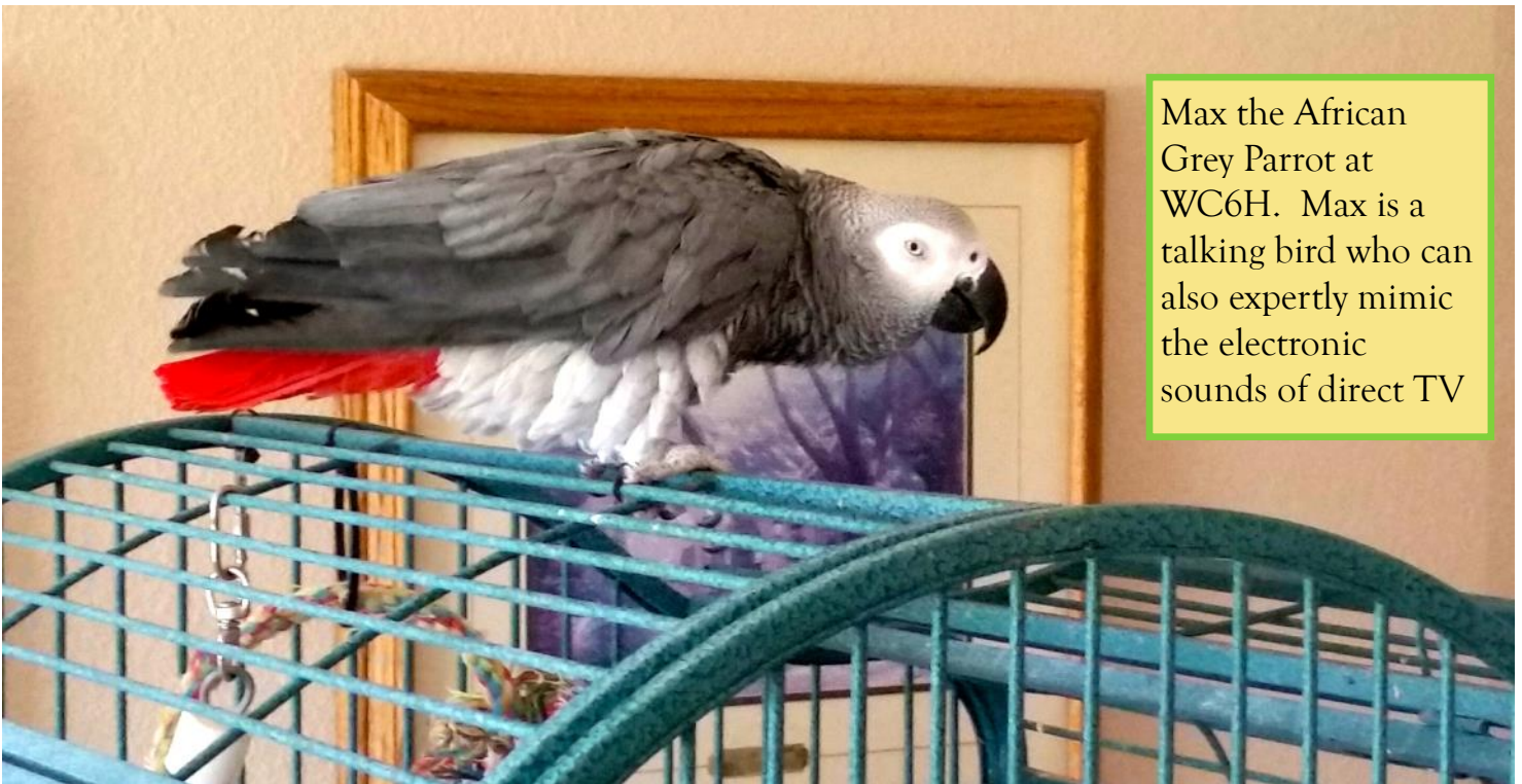
Max the African Grey Parrot at WC6H. Max is a talking bird who can also expertly mimic the electronic sounds of direct TV