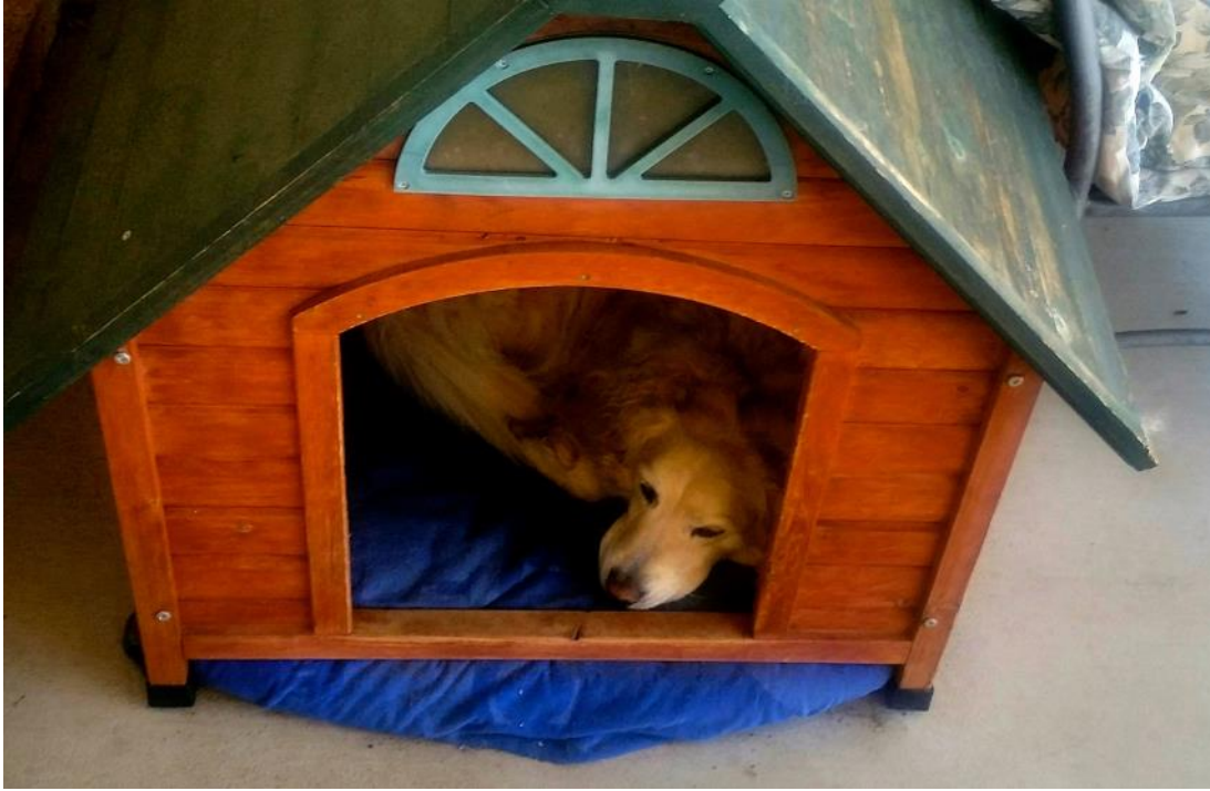
Goldie the golden retriever at home at WC6H