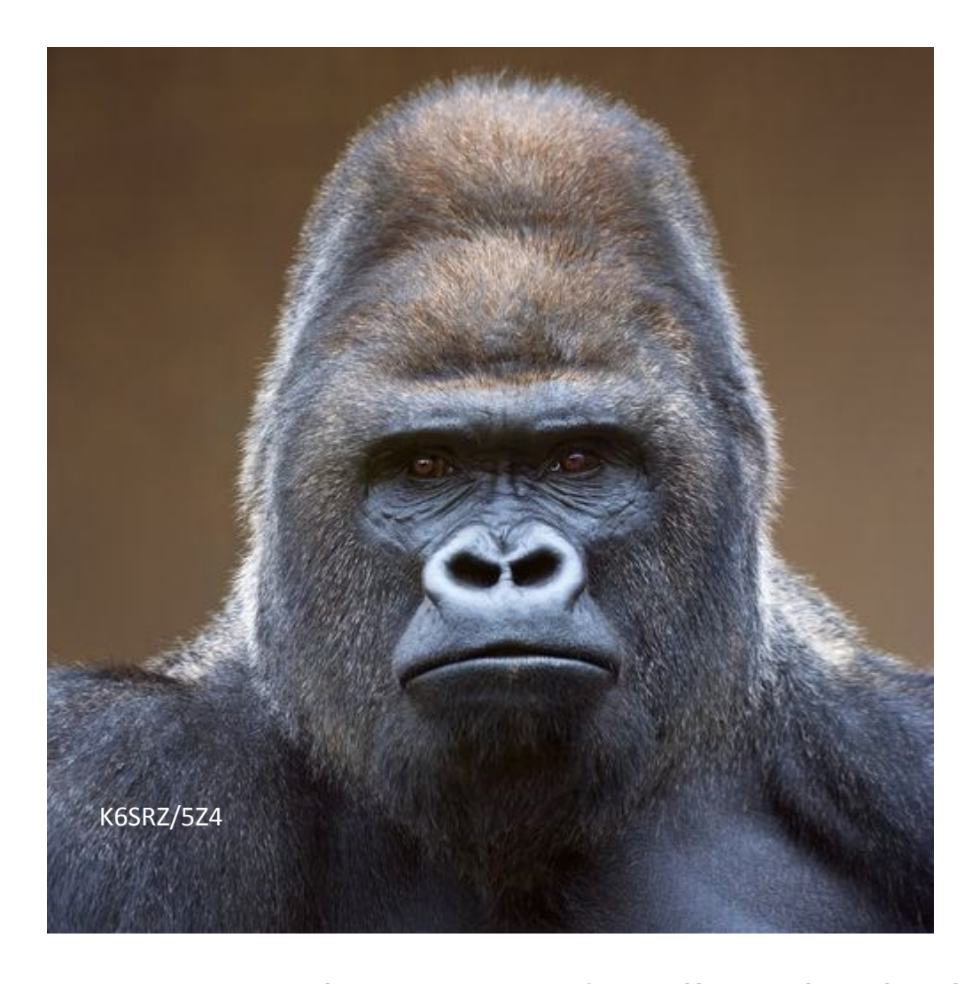
The 800-pound gorilla in the shack