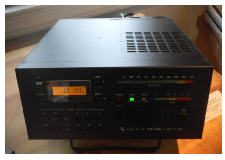
Answer: a KPA 5000 after a firestorm