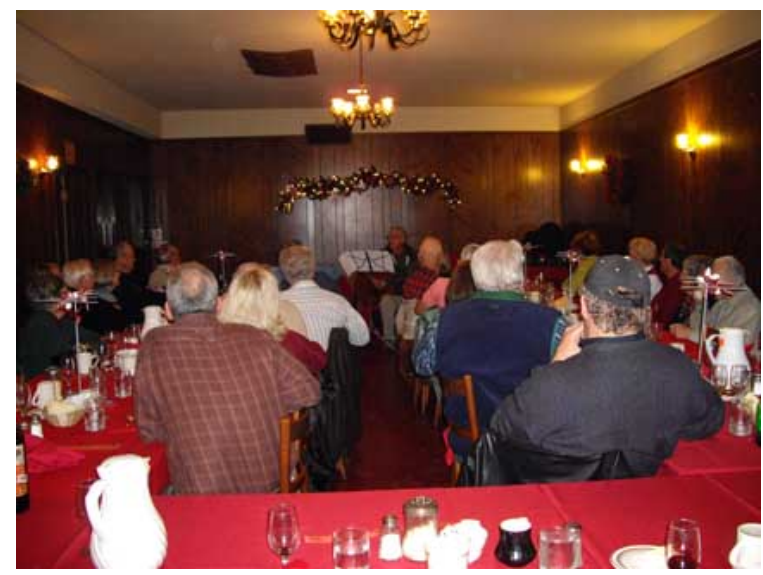
REDXA Christmas Party 2008