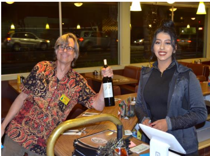
W6XU and friend at the Boulevard Café for our 2017 holiday party