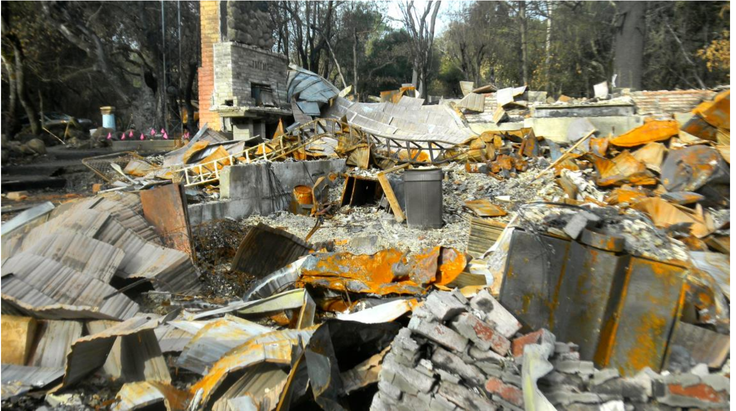
Some of the damage at WX6B