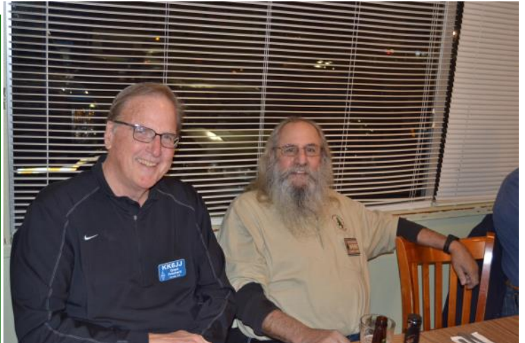
KK6JJ and W6WR