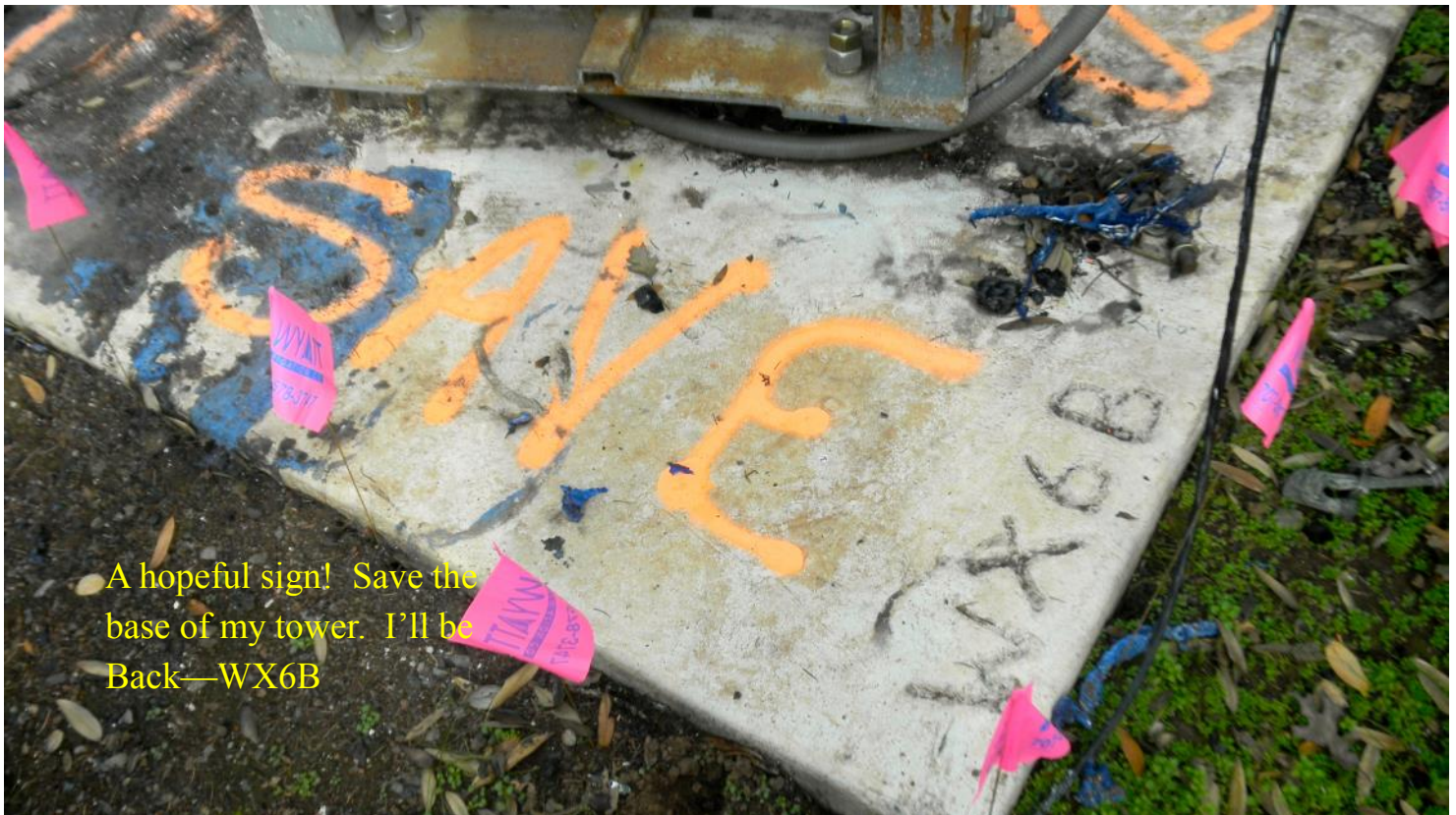
A hopeful sign! Save the base of my tower. I'll be Back—WX6B