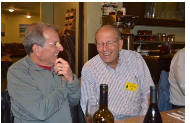
K6ANP and K6RIM