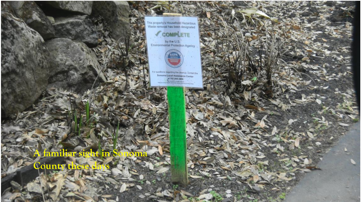
A familiar sight in Sonoma County these days