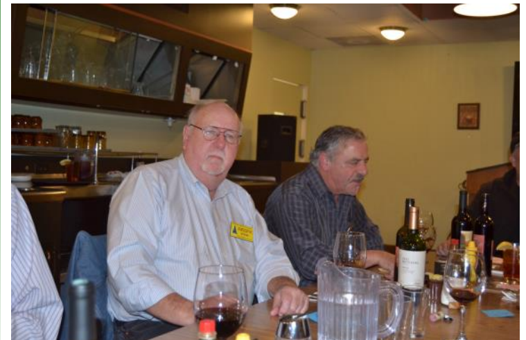
W6SFK and K6JS