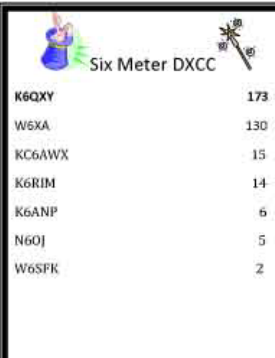
N6OJ enters the fray on the magic band

(including deleted) worked for WARC Bands, 160 Meters, Digital modes, Mobile, 6 Meters or your total for 80,40,20, 15 and 10 for 1.5K. Club. Countries do not count until HQ Awards Committee takes action and announces a start date for a new country.