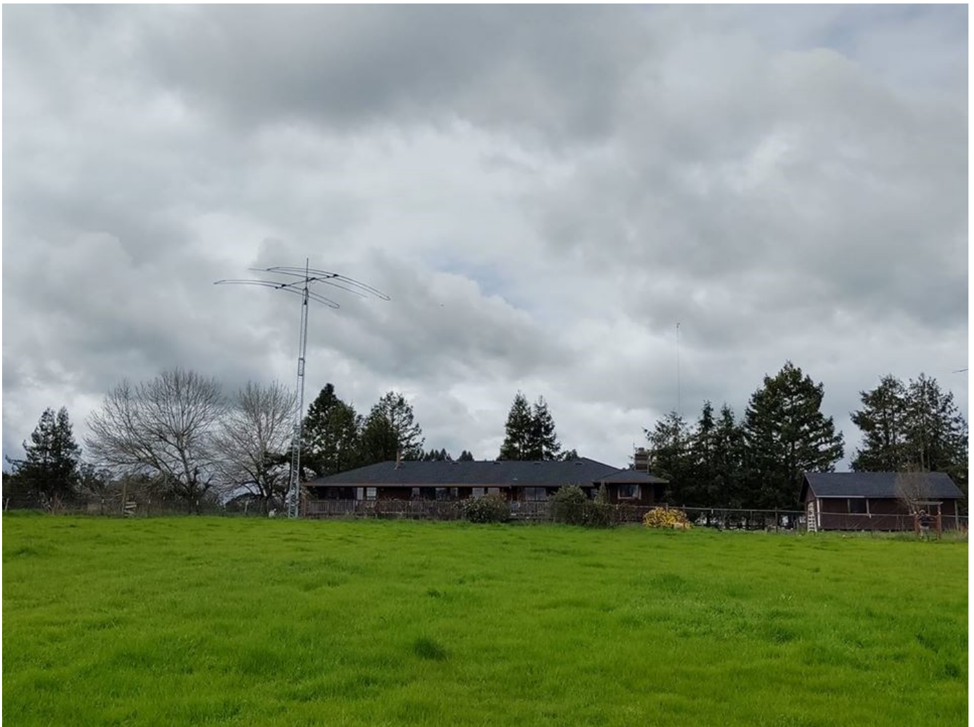
After a short rain (0.1 inches) at K6SRZ