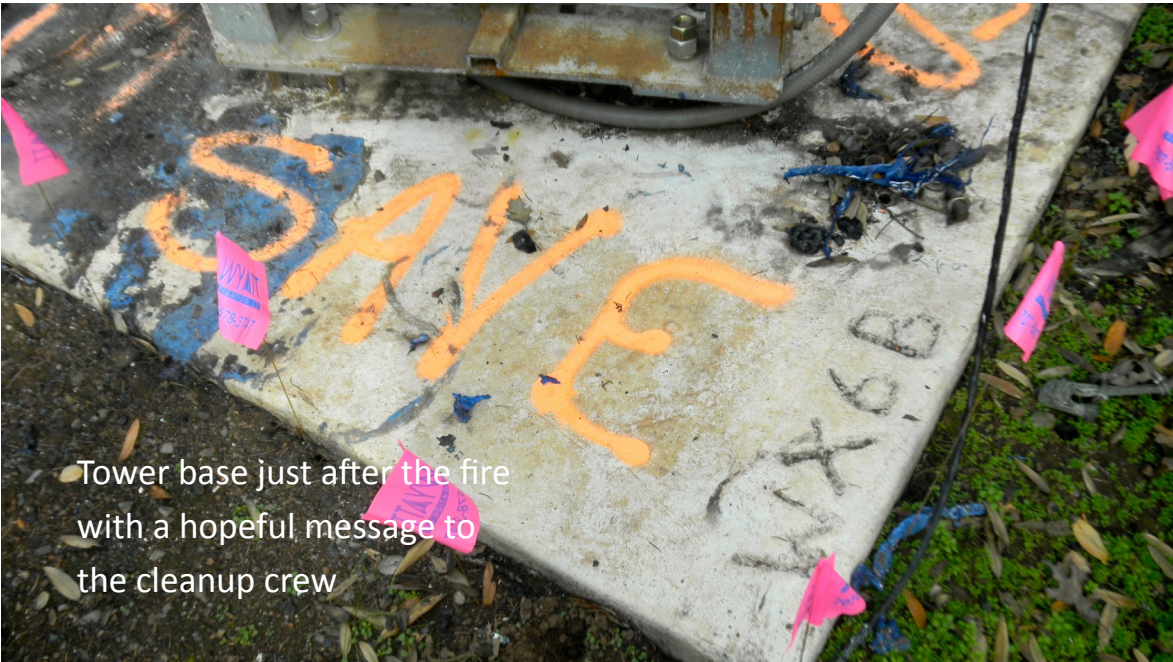
Tower base just after the fire with a hopeful message to the cleanup crew