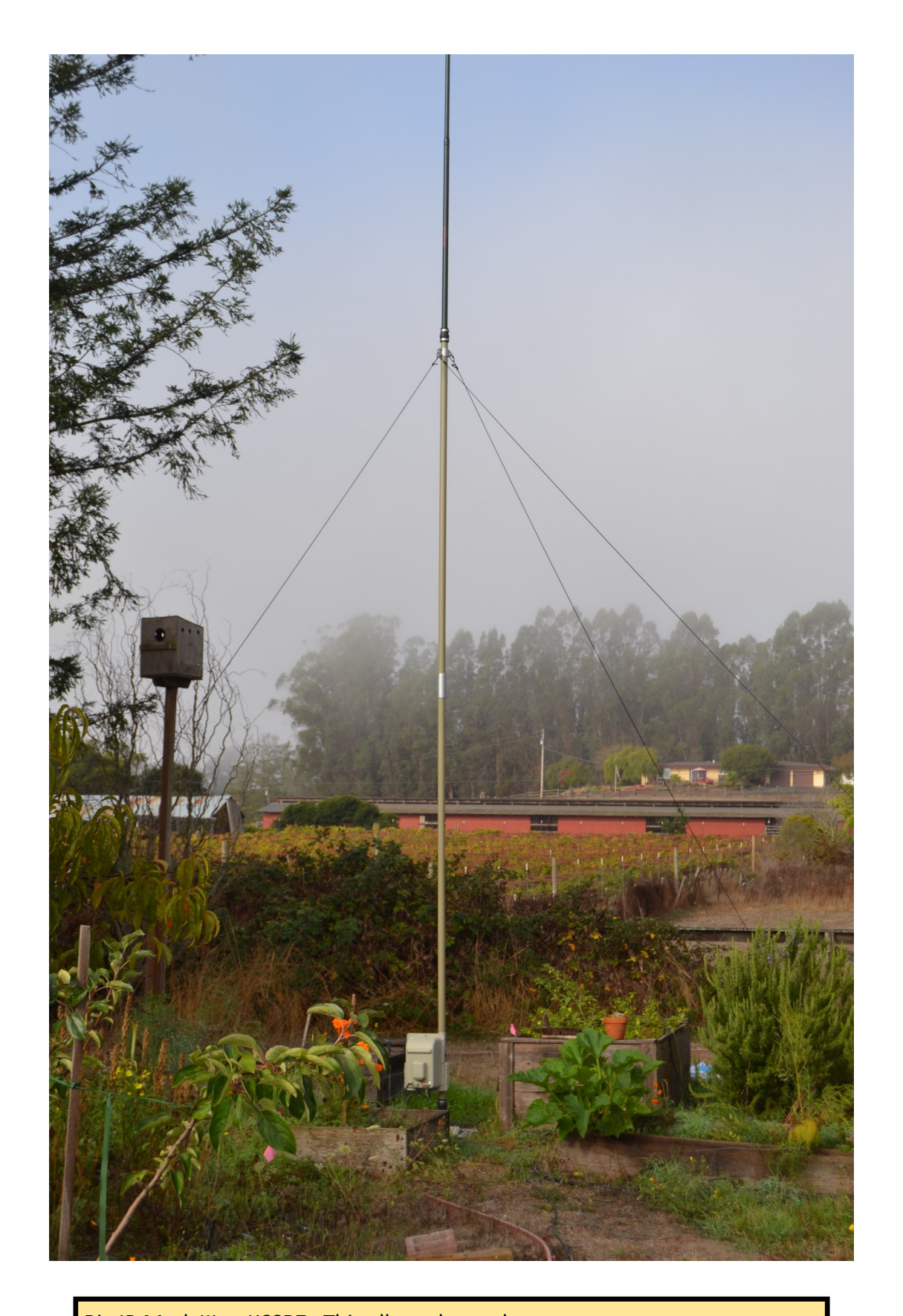
Big IR Mark III at K6SRZ. This allowed us to have a resonant antenna on both 75 and 80 Meters. A brand new antenna and only used for about an hour during CQP. BTW, it's for sale!