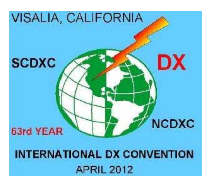
April 20-22, 2012

See <a href="http://www.hornucopia.com/contestcal">http://www.hornucopia.com/contestcal</a> for more Contest Schedules.